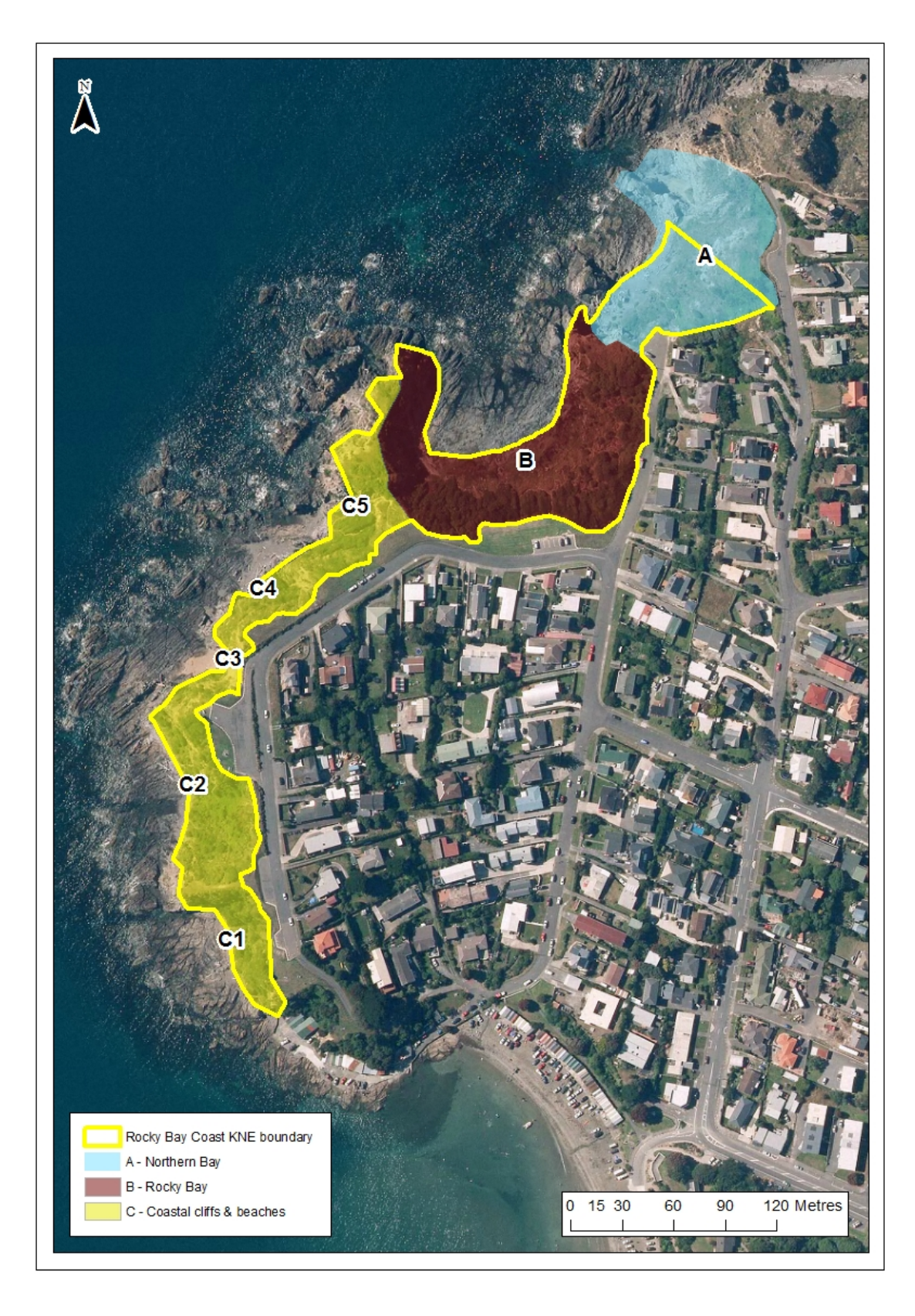
Map 3: Operational areas in the Rocky Bay Coast KNE site. In operation area C, each bay between the rocky spurs is defined as a subgroup of the total area to more easily define specialised work to be carried out.