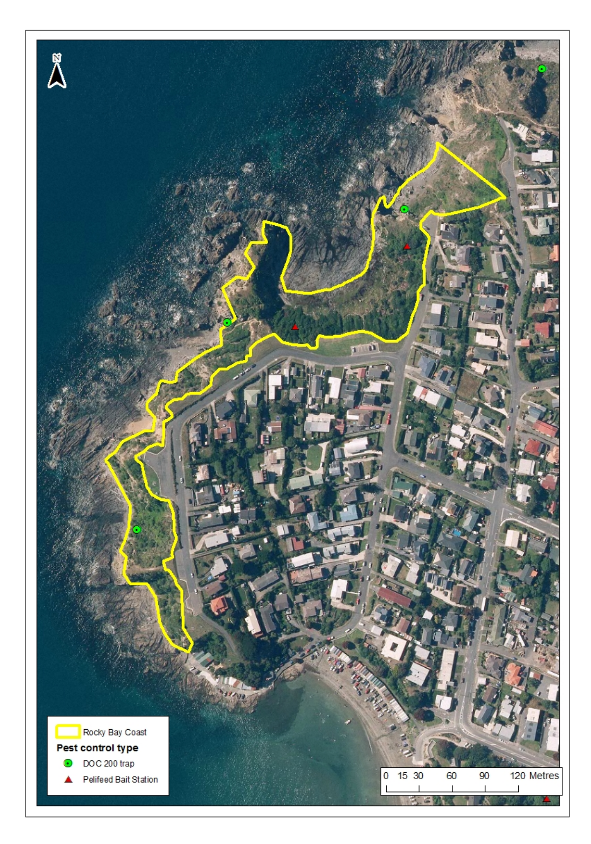
Map 4: Pest animal control in the Rocky Bay Coast KNE site.