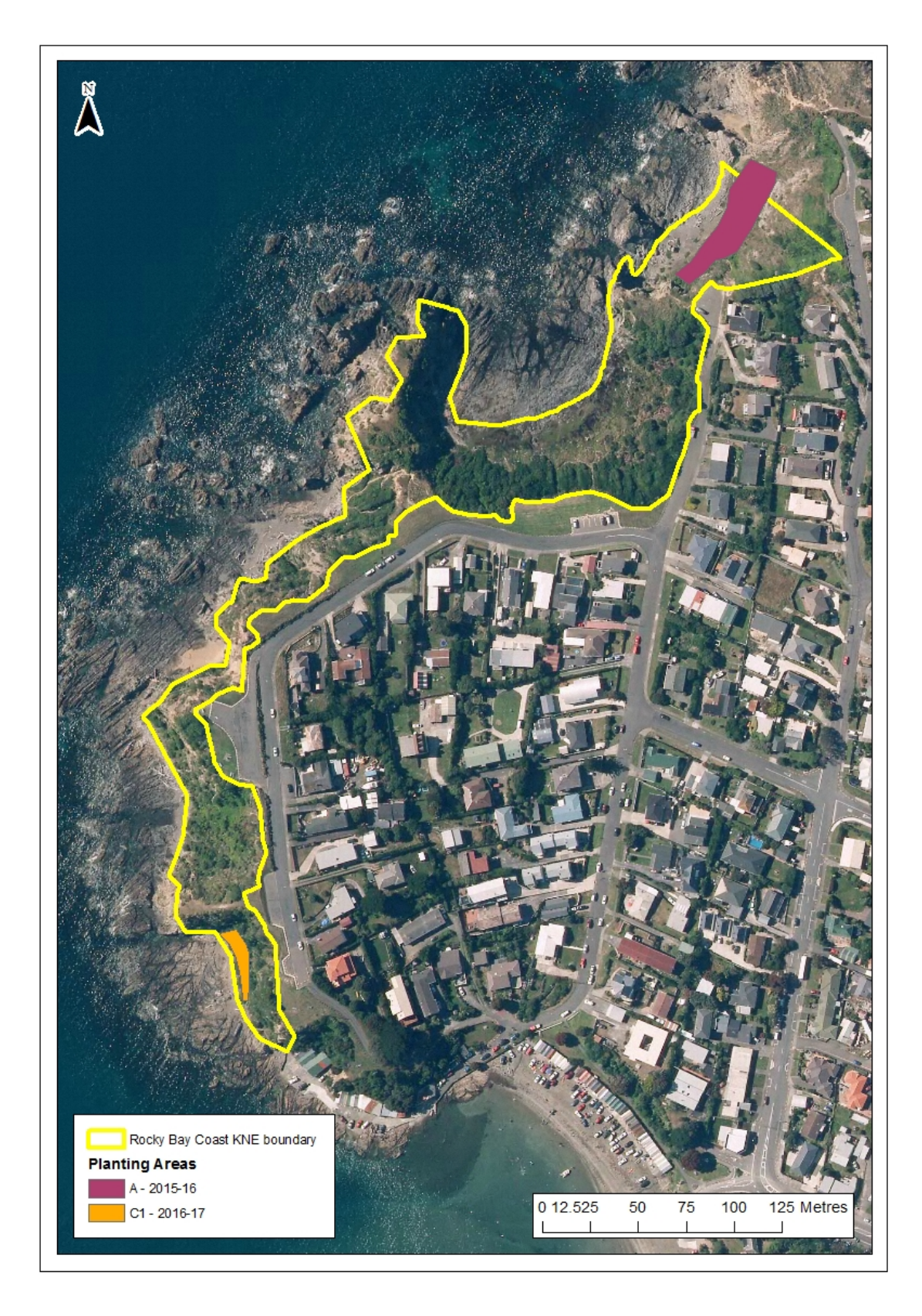
Map 5: Planting areas in the Rocky Bay Coast KNE site.