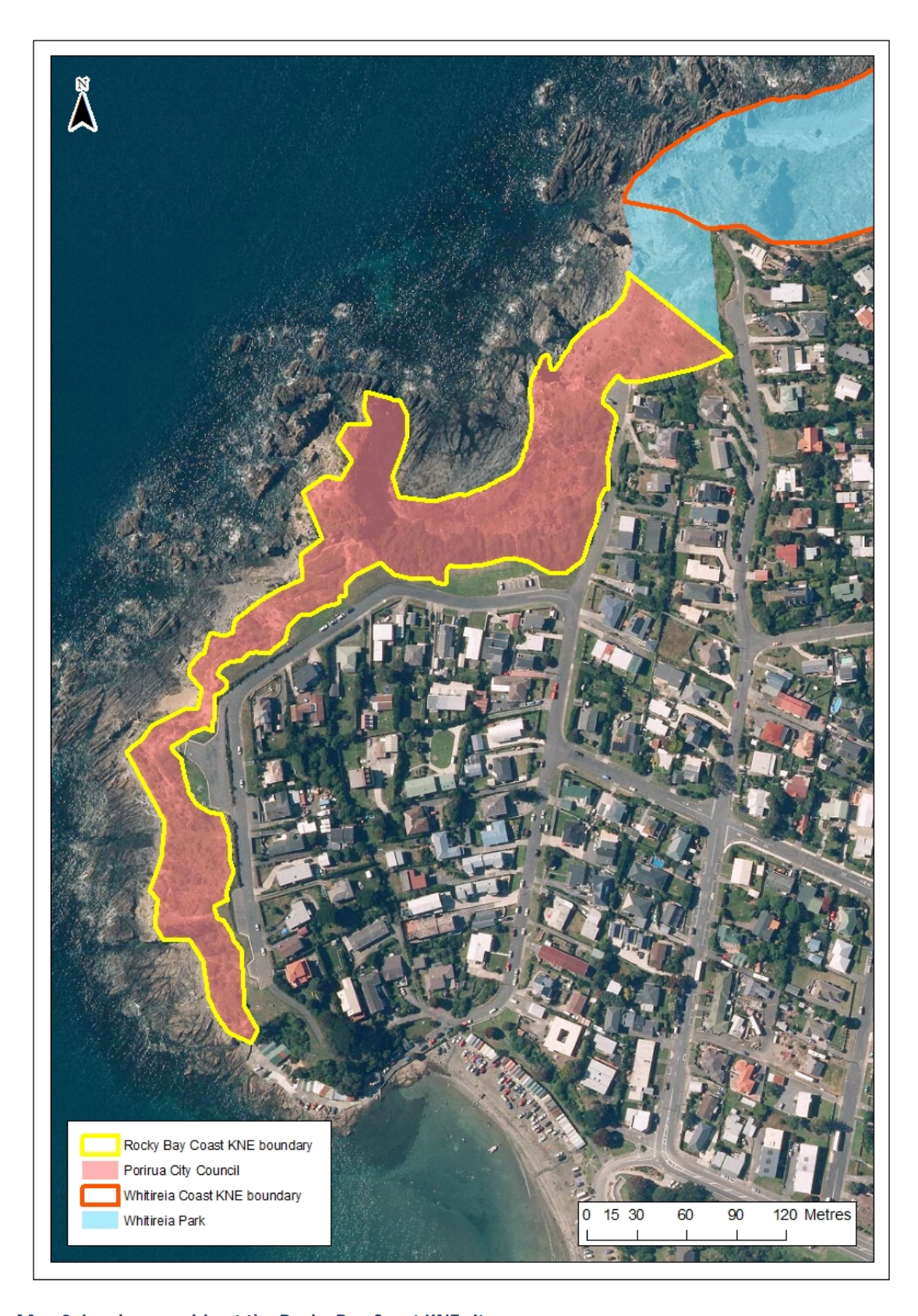
Map 2: Land ownership at the Rocky Bay Coast KNE site.